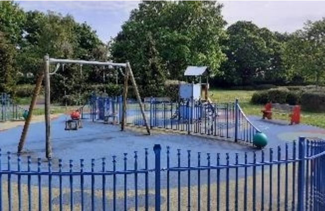
Small: Princess Gardens & Shelley park. c.£70k