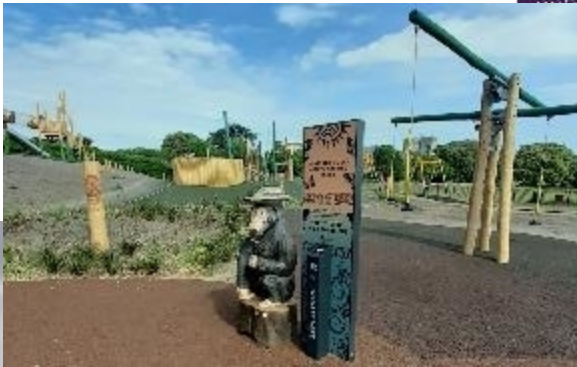
Large: Branksome Recreation Ground & Alum Chine c. £160k